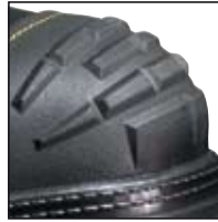
PROFILED RUBBER TOE CAP